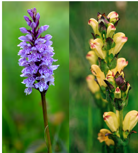
Moorland spotted orchid Dactylorhiza maculata and moor-king lousewort Pedicularis sceptrum-carolinum grow by the tree line.