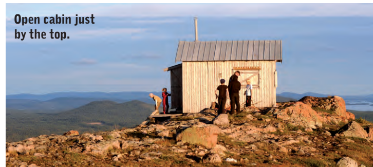
Open cabin just by the top.

View: Lake Uddjaur fills the view with its islet-crowded archipelago landscape. The nearest villages are Mellanström and Kasker, south and south-west of the peak. In Sámi veälbmá means calmly flowing water, a backwater, possibly with much greenery around. Buovdda means 'bald head'. From the north side of the peak you can see Lake Hornavan and in the north-west the border mountains in Norway.