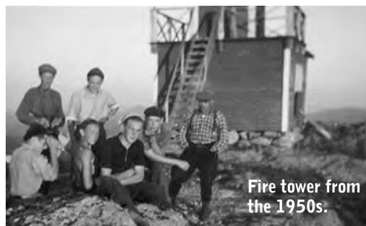
Fire tower from the 1950s.

A glimpse of history: Before there were roads to travel on, most transports were made along the lake systems. As early as the 10th century there was a trade route in place between Arjeplog and the Norwegian coast. Among the older trails are those established in connection with operations at the Nasafjäll mine in the 17th and 18th centuries. You can still encounter corduroy roads from that period. But most transports were done in winter, on frozen lakes and marshland. Some of the first settlers in Arjeplog municipality came to the shores of Uddjaure towards the end of the 17th century, many of Sámi descent. In the beginning of the 20th century a fire watch tower was built on the peak. In summer there was staff on site. Operations ceased