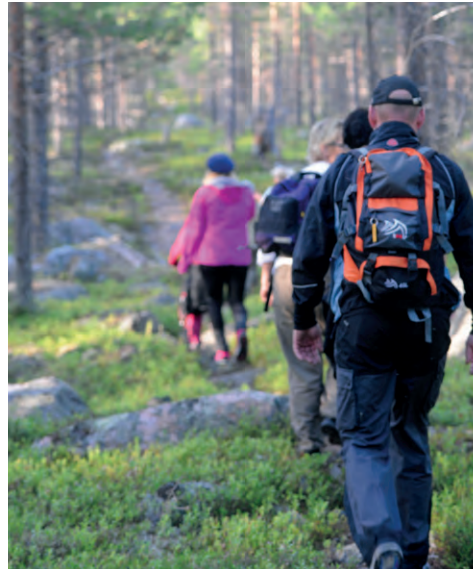
The path begins in a pine forest. After a kilometre the ascent begins. The steepest section features gravel and small stones.

Nature: From pine forest at the starting point with blueberries, lingonberries and crowberries, where extensive logging and planting has been carried out, to natural forest with traces of older, selective logging closest to the top. At the tree line there is a small marshland where the moorland spotted orchid grows, then mountain heath with shrubs and willow takes over. By the cabin at the top there are rock outcrops and boulders, mountain birch and purple mountain heather.