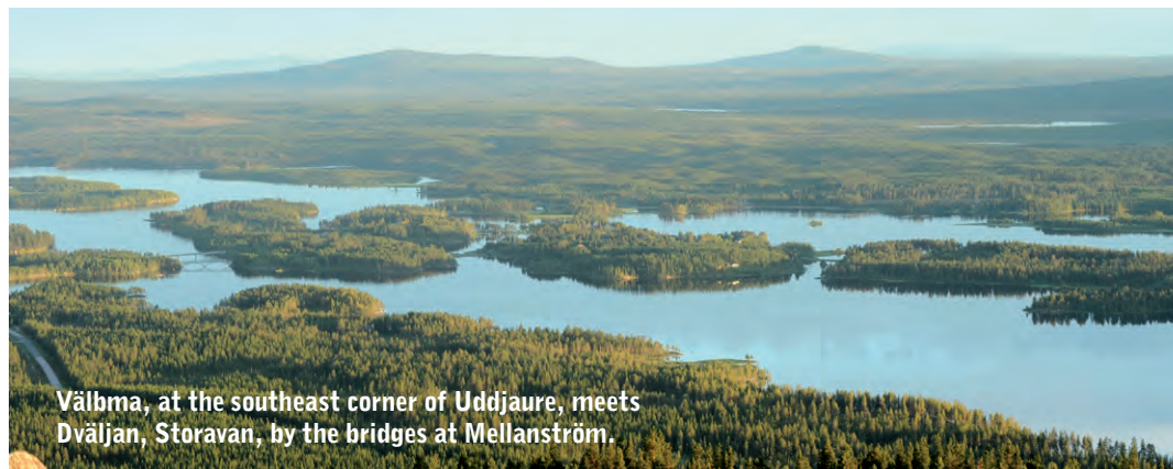
Veälbmá, at the southeast corner of Uddjaure, meets Dväljan, Storavan, by the bridges at Mellanström.

The trail guide series is published by Arjeplog Municipality using state aid for local nature conservation projects (LONA) through the County Administrative Board of Norrbotten. Feel free to use the mountain map to plan your hikes: www.kso2.lantmateriet.se . The guides are available for download here: www.arjeplog.se/utflyktsguider . Arjeplog Municipality © the Swedish National Land Survey, Geo-Data Cooperation.