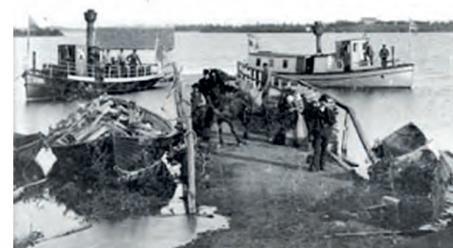
Boat traffic used to be regular on Uddjaure, as well as timber rafting.

during the 1960s when the tower blew down. Veälbmábuovdda used to be a popular hiking destination, especially during summer weekends. Further reading: Mullholm – in the middle of Lapland [Mullholm – in the middle of Lapland], by Lise-Lotte B Modig (2006).